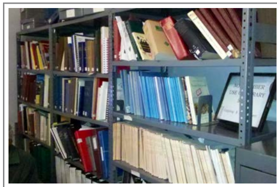
The old metal shelving